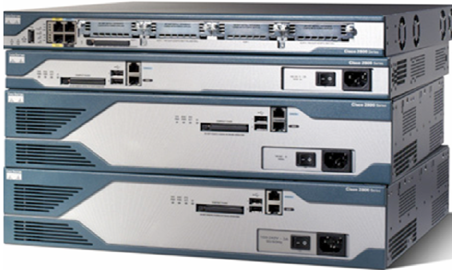
Figure 1. Cisco 2800 Series

Cisco Systems ® , Inc. redefined best-in-class enterprise and small- to- midsize business routing with a new line of integrated services routers that are optimized for the secure, wire-speed delivery of concurrent data, voice, video, and wireless services. Founded on 20 years of leadership and innovation, the Cisco ® 2800 Series of integrated services routers (refer to Figure 1) intelligently embed data, security, voice, and wireless services into a single, resilient system for fast, scalable delivery of mission-critical business applications. The unique integrated systems architecture of the Cisco 2800 Series delivers maximum business agility and investment protection.