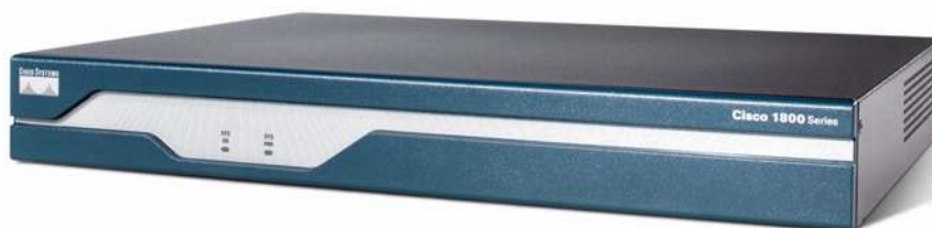
Figure 1. Cisco 1800 Series Integrated Services Routers

Support of high-density WICs (HWICs) is optional.