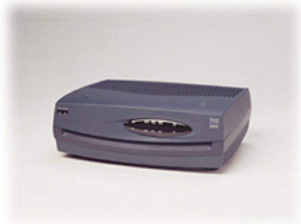
Figure 1 The Cisco 1750 modular access router integrates voice and data services on a single network to dramatically reduce long-distance toll charges. Its compact, modular form adapts easily as business needs evolve.

All Cisco 1750 models offer three modular slots for voice and data interface cards, an autosensing 10/100BaseT Ethernet LAN port, a console port, and an auxiliary port. The Cisco 1750 supports the same WAN interface cards as the Cisco 1600, 1720, 2600, and 3600 routers, and the same analog voice interface cards and voice-over-IP technology as the Cisco 2600 and 3600 routers, simplifying spanning support requirements. The WAN interface cards support a wide range of services, including synchronous and asynchronous serial, Integrated Services Digital Network Basic Rate Interface (ISDN BRI), and serial with DSU/CSU options for primary and backup WAN connectivity. The voice interface cards include support for Foreign Exchange Office (FXO), Foreign Exchange Station (FXS), and Ear & Mouth (E&M). Combined, these interfaces support a comprehensive set of applications, including multiservice voice/fax/data integration, Frame Relay, ISDN BRI, SMDS, X.25, broadband DSL and cable services, VPNs, and more.